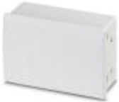
Replacement cover for base unit